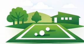
Places & Spaces